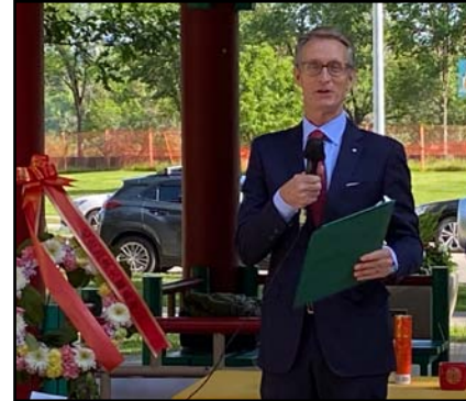
Commemorating 4,000 Chinese Railway Workers who lost their lives.