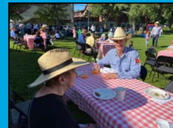
From top left: Stampede at the Mustard Seed, Marda Gras, Inglewood Sunfest, breakfast in Elbow Park.