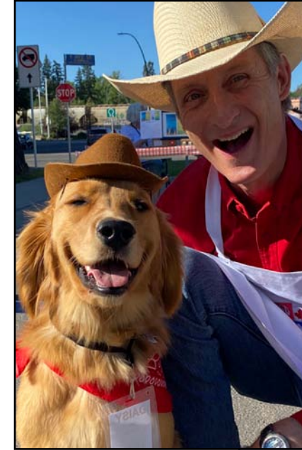
Alexandra Centre Stampede breakfast

Including Indigenous workers in our prosperity (May 31)