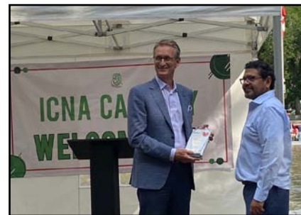
Muslim Heritage Day