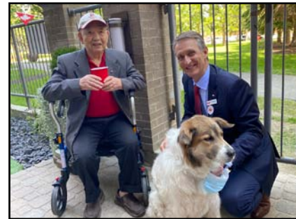
Canada Day at the Clover Living residence