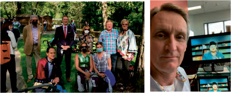
Above: At the opening of the Calgary Zoo reptile exhibit; most of my meetings are virtual these days: this is virtual Ramadan. Below: I co-hosted some Ontario MP colleagues in Calgary; the residents of Manor Village at Garrison Woods virtually walked across Canada; I joined them as they dipped their toes in the Atlantic; in Ottawa for a COVID meeting.